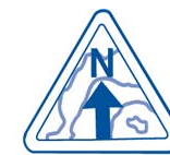
Map and Compass