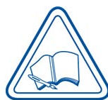
Reading and Writing