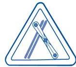
Snow Ski and Board Sports