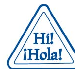
Language and Culture